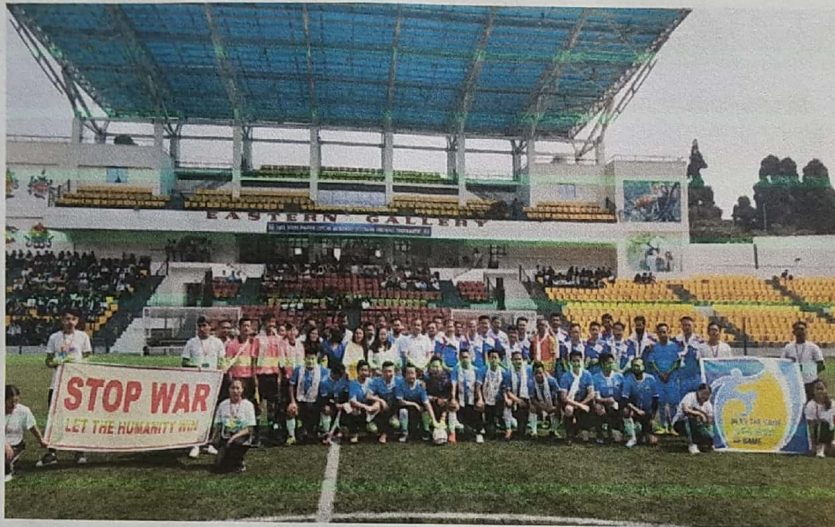
Photo: Exhibition Match: Chief Guest along with the team NBBGC, Tadong and SGC, Namchi.

The department of physical education organised a two week inter-department football tournament. The tournament was organized under the theme “Stop War” and also emphasized on all round development of the students and to promote health awareness. All together 19 departments participated in the tournament.