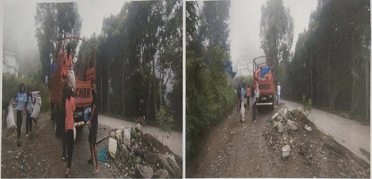
Photo 2: Collection of waste by the NMC garbage truck twice a week.